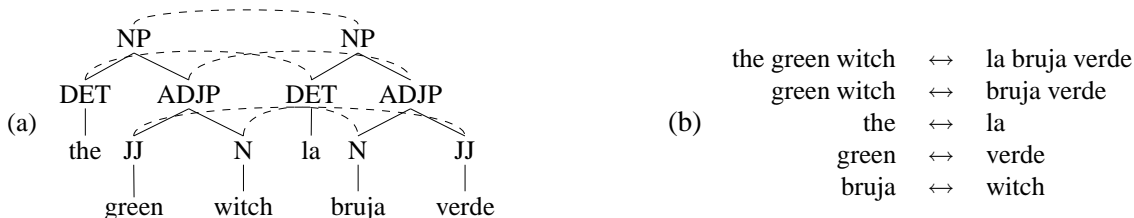
Figure 1: Example of (a) a parallel treebank entry and (b) the set of extracted phrases.

The first step in producing a set of constituent-based phrase pairs is to build a parallel treebank. To do this, each side of a sententially aligned parallel corpus is monolingually parsed using available phrase-structure parsers, e.g. the Berkeley parser [19]. Following this, a set of sub-sentential alignments is introduced between the constituent nodes in each tree pairs[26, 30]. These alignments imply translational equivalence between the surface strings dominated by the aligned node pair, thus, given a fully aligned parallel treebank, a set of phrase pairs is extracted based on all node alignments. An example of this process is illustrated in Figure 1.